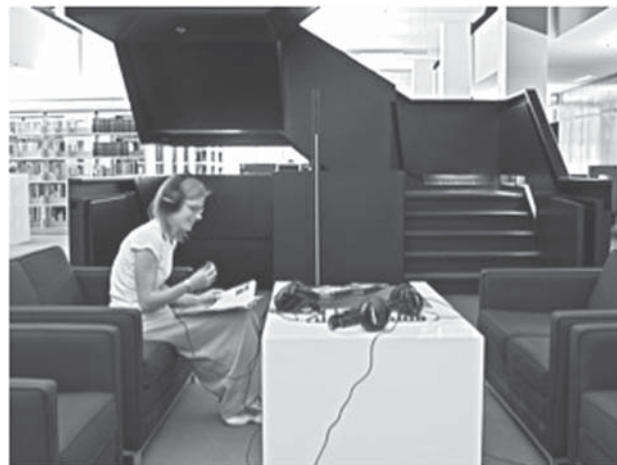
Figure 4. McGill University Marvin Duchow Music Library.