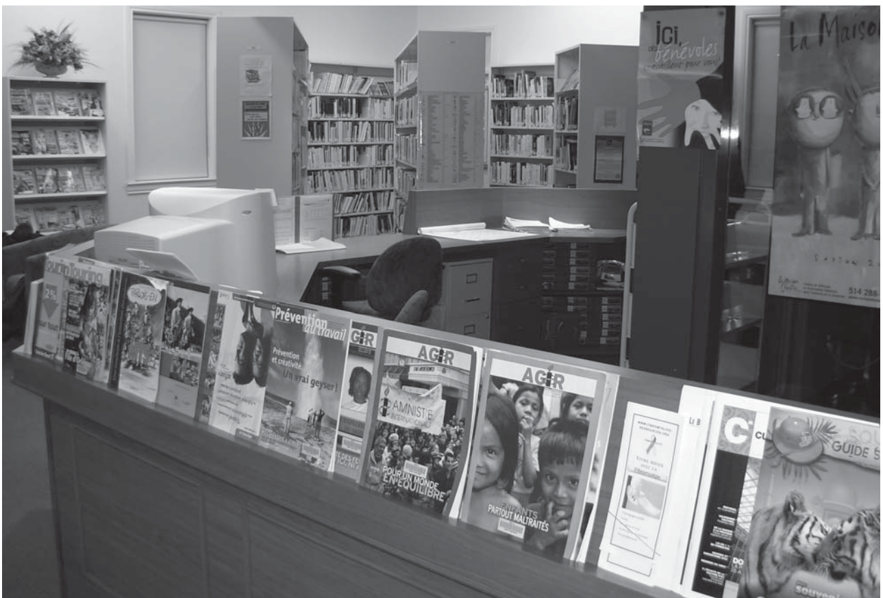
Figure 16. The public library of Sainte-Clotilde-de-Châteauguay: interior.