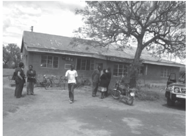
Figure 3. Navaisha library building.

The same information wave hit Naivasha when the KNLS Board visited the area and mooted the idea of a Community Library to the Council. Back in the late 1970s and early 1980s, the government of Kenya sanctioned the sale of traditionally brewed beers. As this was legal, provision was made for it and most trading centres had designated beer halls where this brew was sold openly. One such hall was to be found in Naivasha, a town that lies at the foot of the Great Rift Valley. There was even provision for meat roasting. Here, the locals congregated daily to partake of their favourite homemade brew.