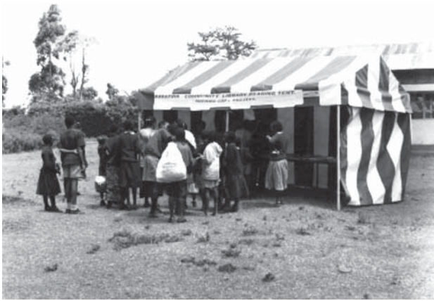
Figure 1. Karatina: exterior.