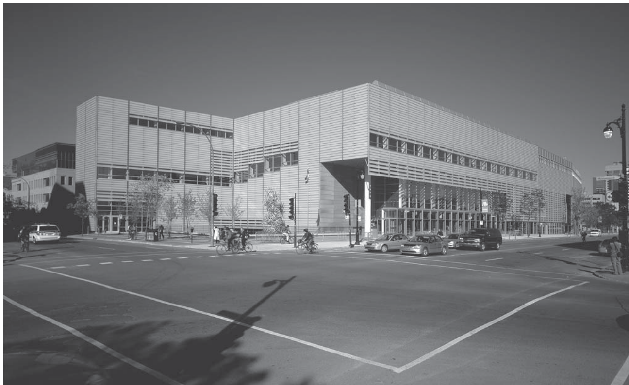
Figure 2. La Grande Bibliothèque: exterior view.

A few years after the decision to go ahead with the new library, the Grande Bibliothèque was merged with the BNQ. The decision was questioned by the library community as it is not common to amalgamate a public library, whose mission is to