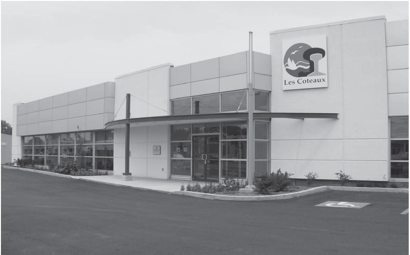
Figure 10. A rural public library, Les Coteaux. Exterior.