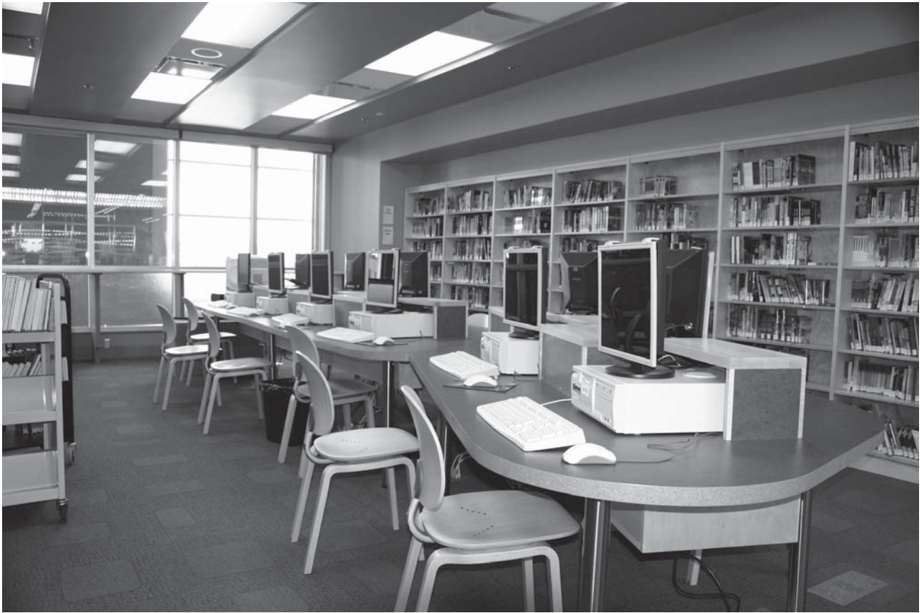
Figure 6. Ottawa Public Library, Greenboro Branch. Interior.