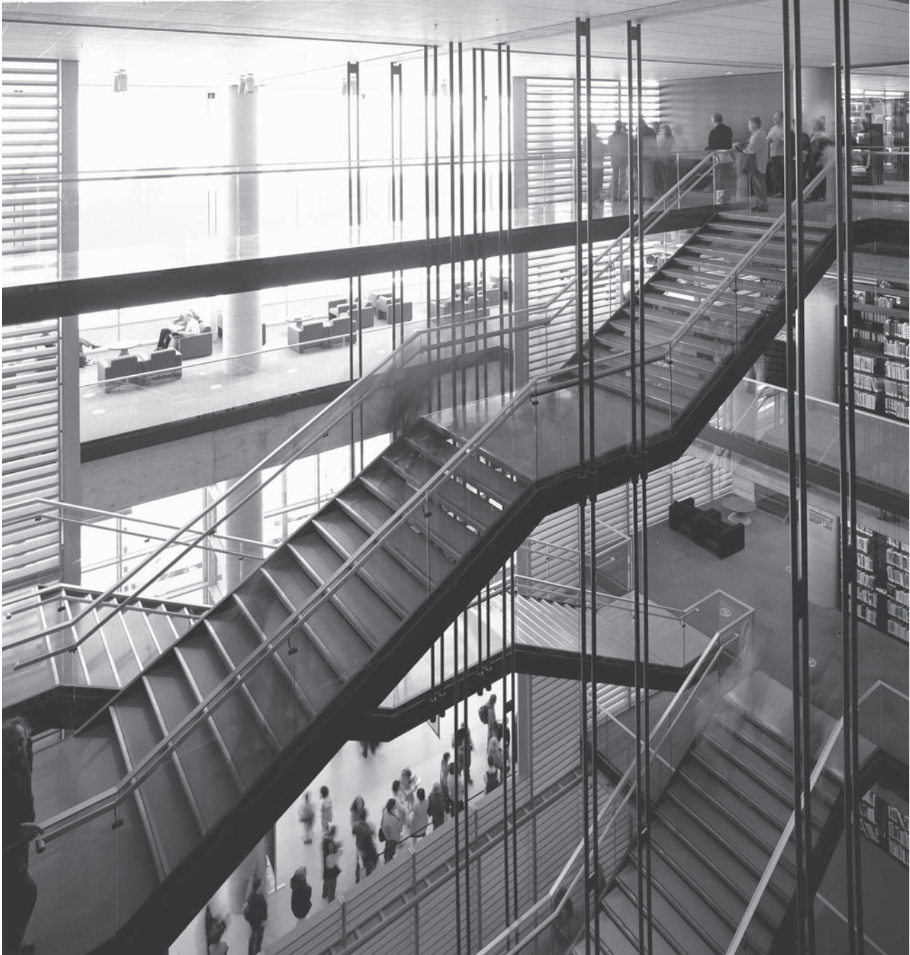
Figure 3. La Grande Bibliothèque: interior view.

disseminate its collections as widely as possible, with a national library whose main responsibility had become preservation. The problem was partly resolved by planning a special enclosed area for the national collection with appropriate conservation conditions in the new building. This very elegant part of the new library, decorated mostly in wood, is named 'Les chambres de bois', after the famous Québec writer Anne Hébert's novel.