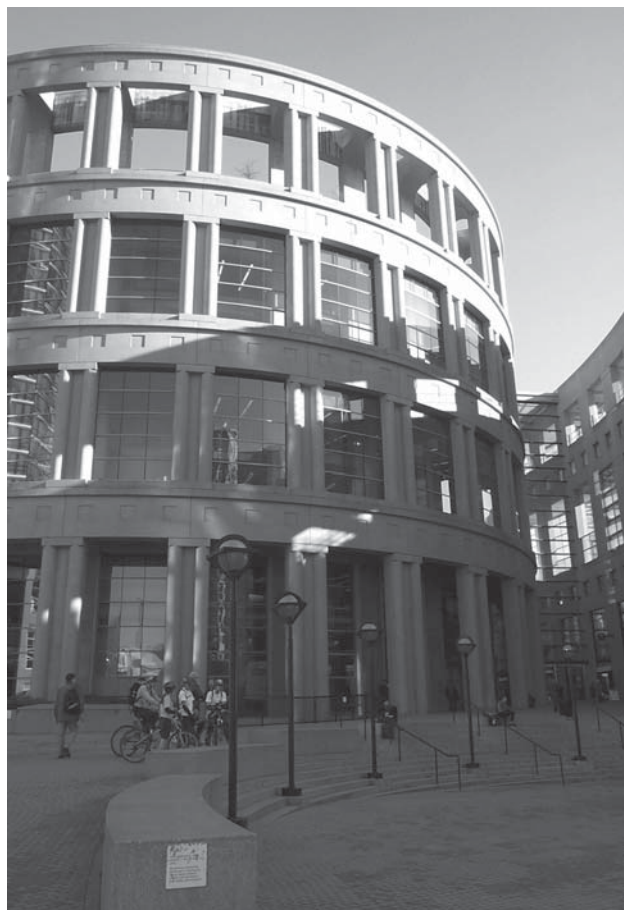
Figure 8. Vancouver Public Library.

Toronto Public Library (TPL) is the largest public library system in Canada, with 99 branches and 11 million items to borrow or use in the library. TPL is also the world's busiest urban public library system. Every year, more than 17 million people visit the 99 branches and borrow more than 30 million items. On the home page of About TPL, the visitor is invited to watch a video on how to use the library in nine languages. 84