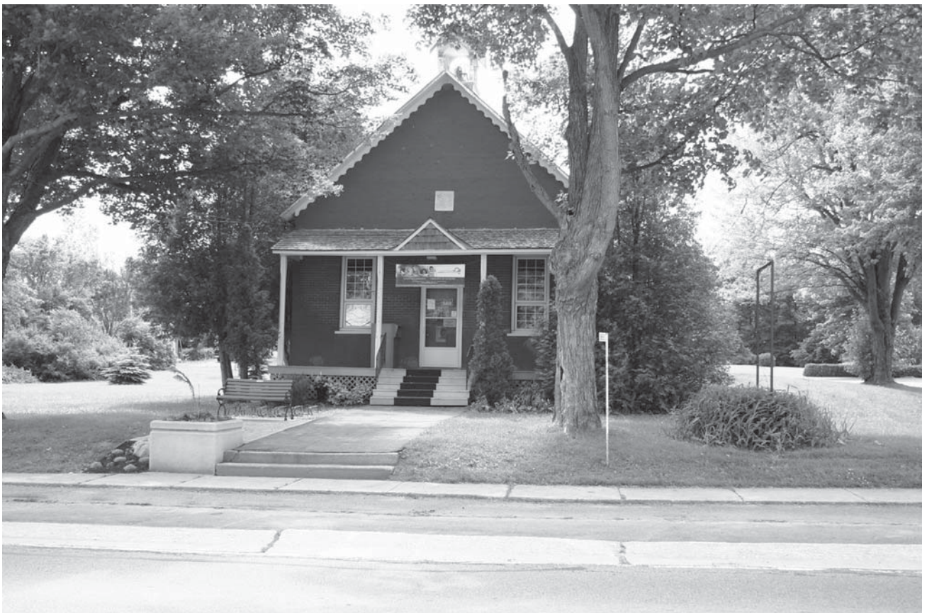
Figure 7. Ottawa Public Library, Vernon Branch.