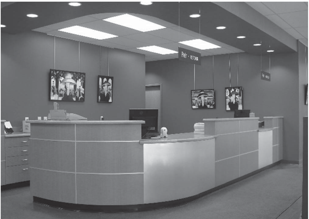
Figure 11. A rural public library, Les Coteaux. Interior.