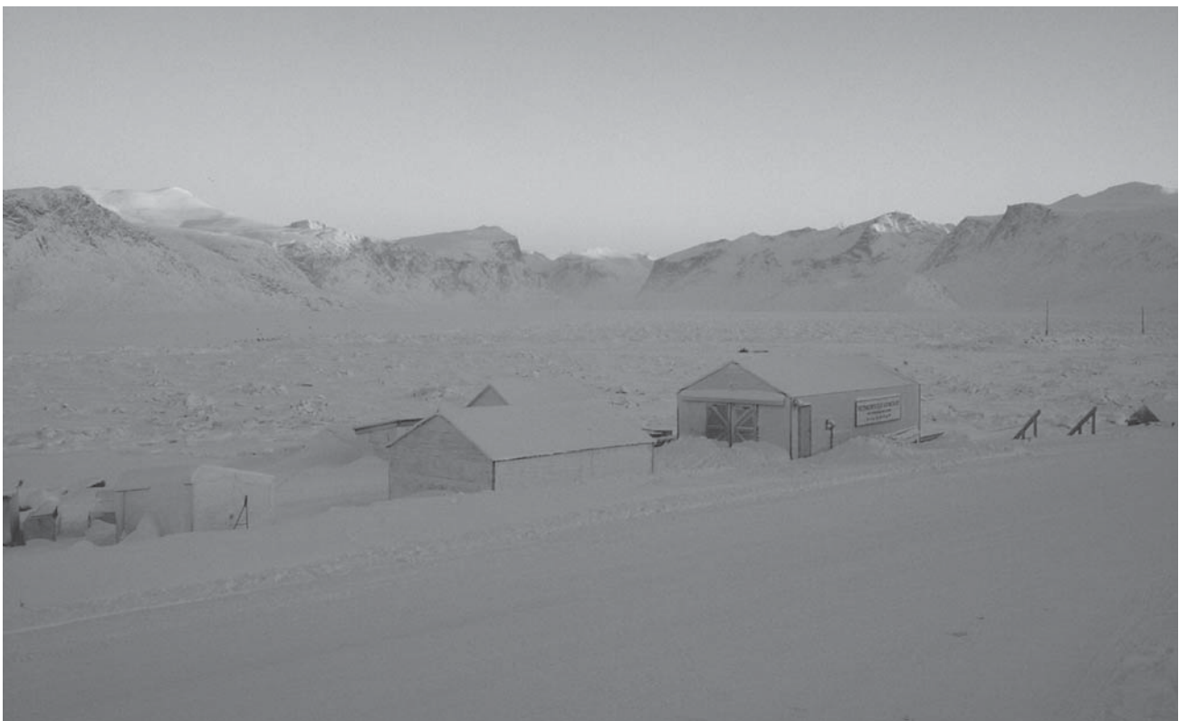
Figure 13. View from the Qimiruwik Library in Pangnirtung with the towering cliffs of the Pangnirtung Fjord.