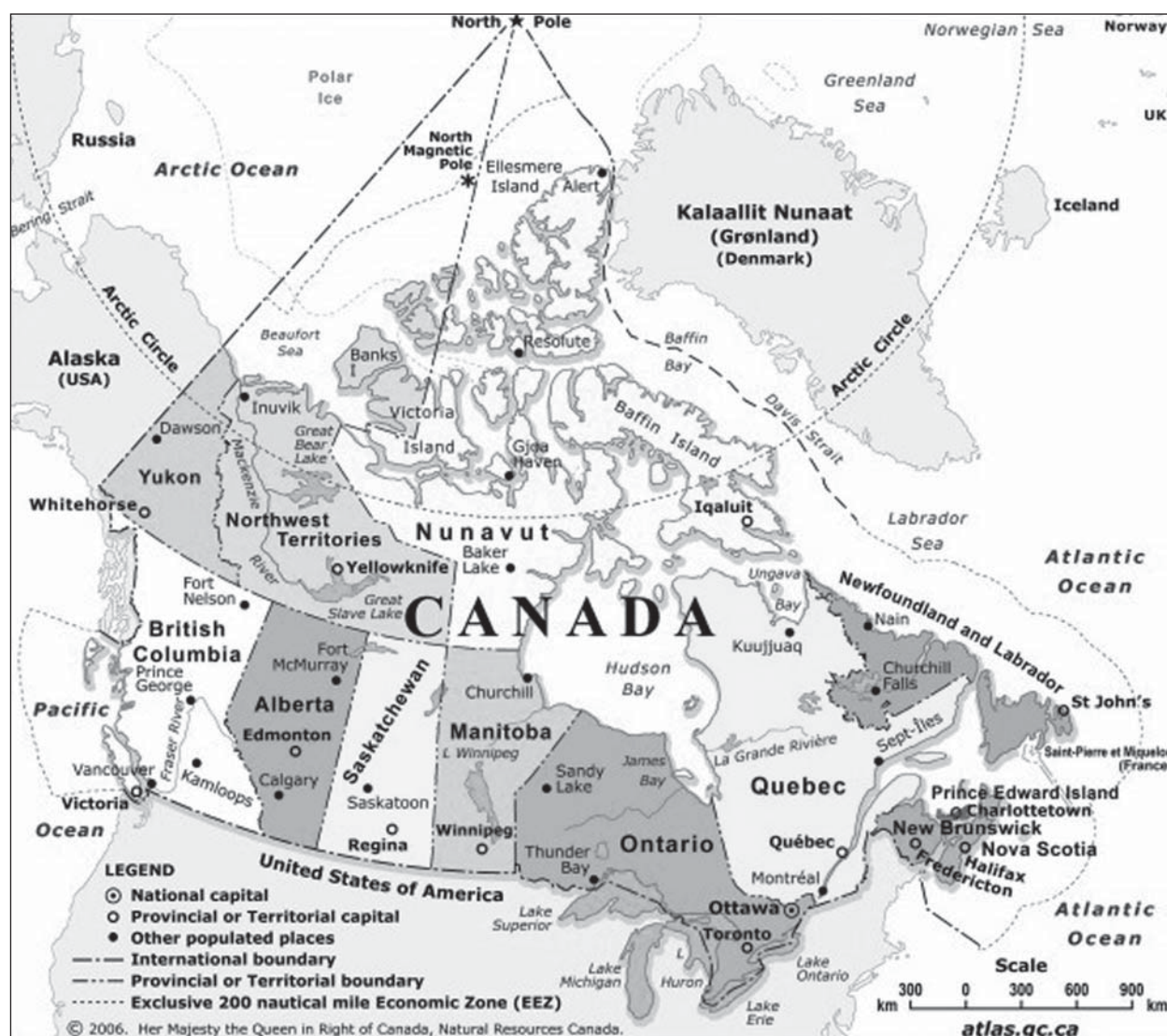
Figure 1. Map of Canada. Original map data provided by the Atlas of Canada http://atlas.gc.ca © 2008. Data reproduced with permission of Natural Resources Canada.

Most Canadians live along a narrow corridor close to the American border. Over 80 percent live in cities and, through immigration and amalgamation schemes over the last decade, the