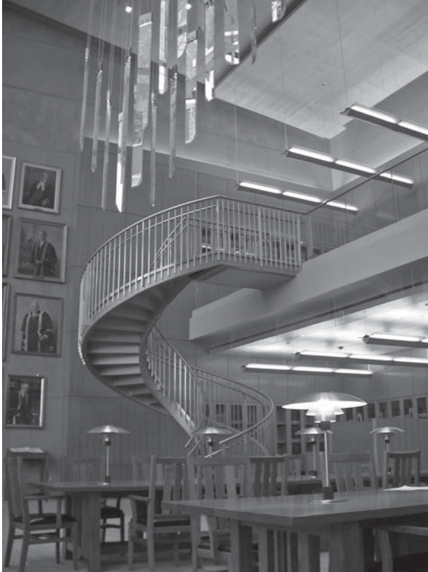
Figure 5. University of British Columbia Irving K. Barber Learning Centre.