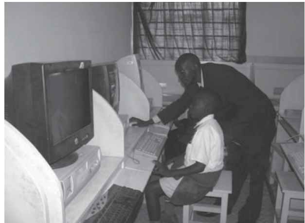
Figure 4. The Navaisha Cybercafé.

The Naivasha Council donated the land and the building and began refurbishment of the building in 1993 from a beer hall to a library. By 3 April 1996 the library was officially opened to the public and the locals changed from drinking beer to reading. The facility has been very well received and currently boasts a clientele of 15,000 on a monthly basis. The local schools and the flower farms in the area are institutional members. They borrow books and use the library. This demonstrates how the thirst for a drink was quickly translated into thirst for knowledge. The people who used to drink beer here are very happy that the facility is now used by their children to gain knowledge.