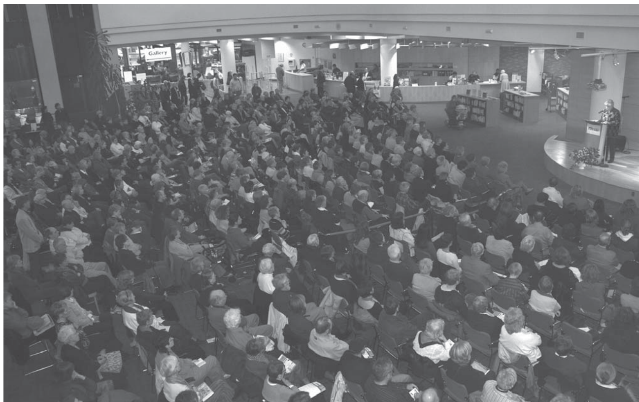
Figure 9. Lecture in the Toronto Reference Library.

On the websites of the larger public libraries, the trends to push more and more to the desktop and to organize materials by target group (e.g. children, teens, seniors) and for subject searches (e.g. genealogy and local history) are evident. Acting as guide, adviser, instructor and respondent to questions, the staff members encourage interaction both physically and virtually. Those who know what they are looking for order online and can now often pick up and return the materials at the most convenient branch. These people spend less time at the library, but many who have never used the public library use the facilities, technologies and collections and services of the library and its partners on a regular basis. It is not uncommon to find a line-up at some of the computers, although public libraries are trying to mirror the commercial world with