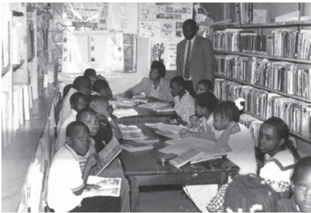
Figure 2. Karatina: interior.

This program is very popular and has had the support of local schools that donated a specified amount of money to start the project. The library is also involved in teacher librarian training. This has especially helped since the introduction of the free primary education program where the government now buys books for schools.