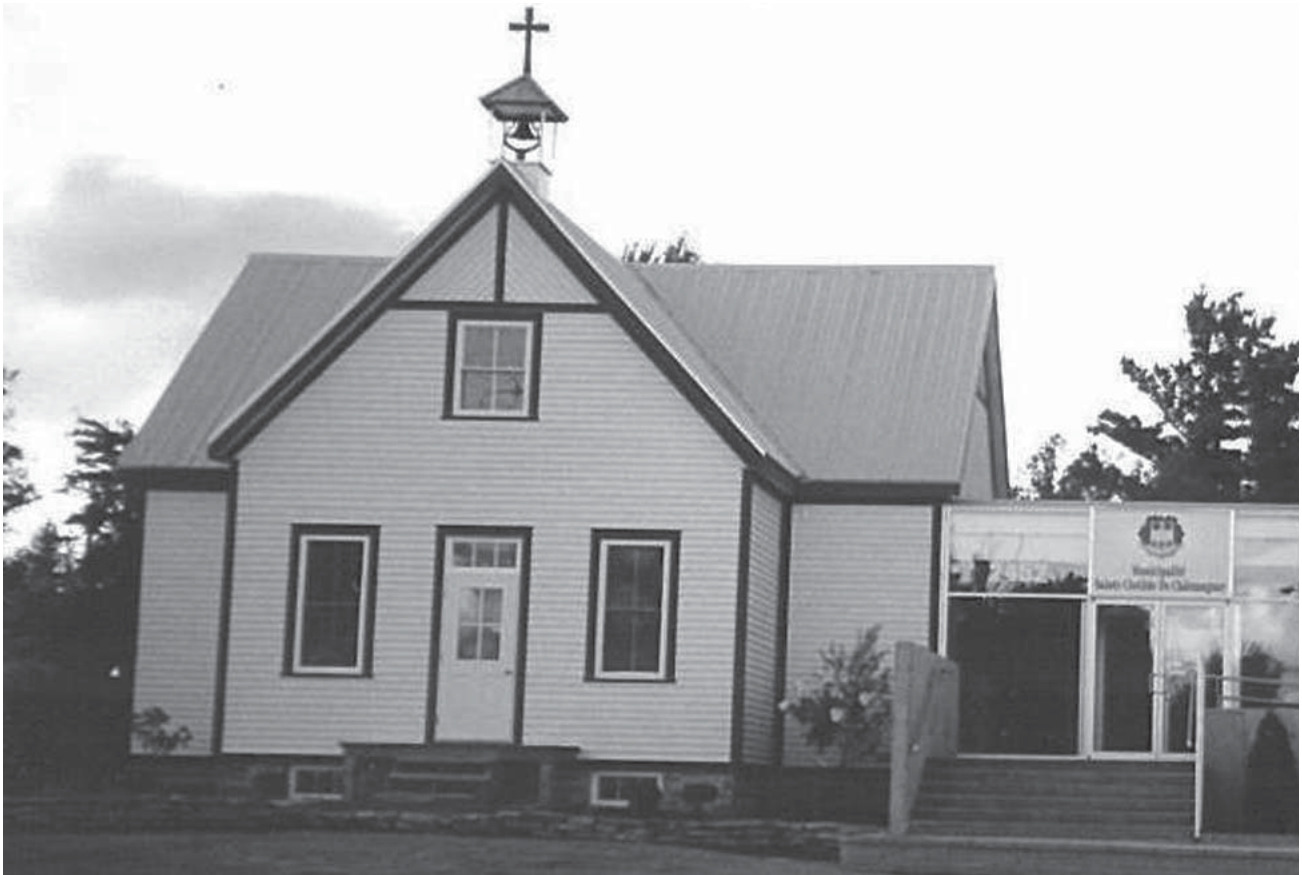
Figure 15. The public library of Sainte-Clotilde-de-Châteauguay: exterior.